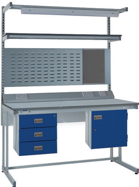
ESD CANTILEVER WORKBENCH KIT 3 WITH TRIPLE DRAWER UNIT