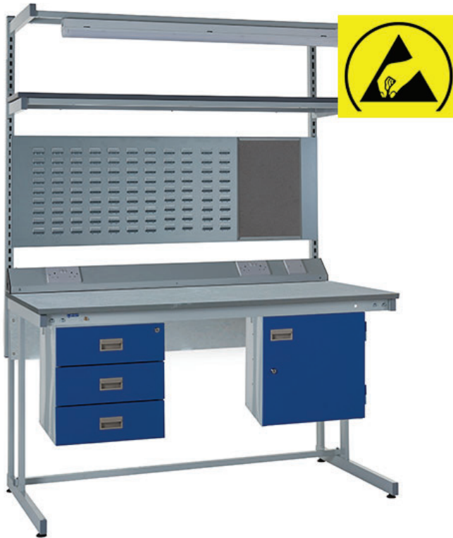
SHOWN ABOVE: CANTILEVER WORKBENCH KIT 3 WITH TRIPLE DRAWER

Static dissipative workbench kits available in 3 different kits to reduce ESD events occurring. Designed with a cantilever leg framework that optimises user comfort.