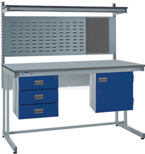
ESD CANTILEVER WORKBENCH KIT 2 WITH TRIPLE DRAWER UNIT