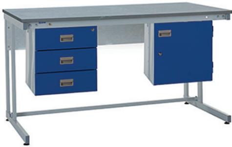
ESD CANTILEVER WORKBENCH KIT 1 WITH TRIPLE DRAWER UNIT